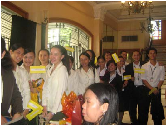
St. Paul-Iloilo delegates registering ...